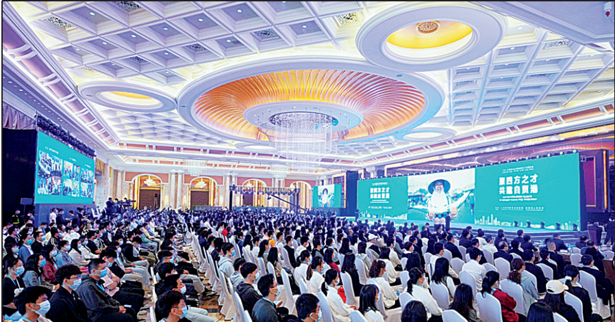
The 2021 Hainan Free Trade Port recruitment event opens at the Hainan International Convention and Exhibition Center in Haikou, Hainan province on Oct 24.

Actions such as the “one-seal for approval”, “online approval” and “unified online government service” as well as the “one-stop service window”, among others, have brought about the smoother flow of global investment, trade and talent to Hainan, according to the provincial government.