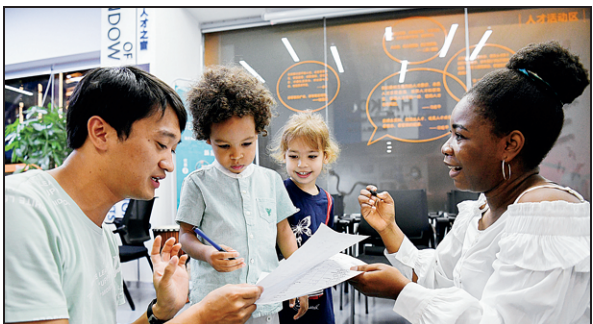
From left: Haikou, capital of Hainan province, is a popular holiday destination. Haikou's Jiangdong New Area bustles with new investment projects. During the Mid-Autumn Festival holiday in September, a staff member of a human resource center in Haikou learns about the needs of foreign nationals.