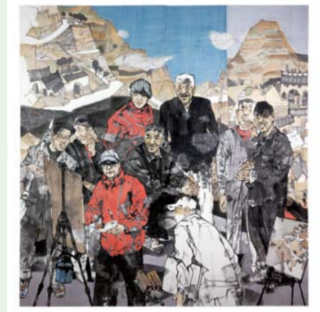
Two paintings — Water Village In Dream (above) and Laughter in the Mountain — created by Luo Weimin and Zhang Weiren are also on display at the exhibition.