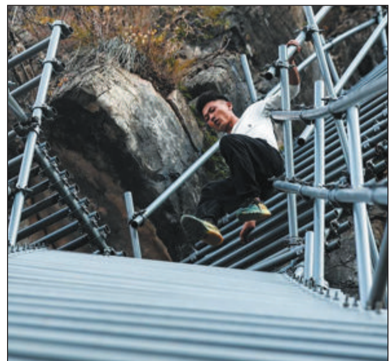
A villager descends from Atulieer village to pick up tourists in November 2019.