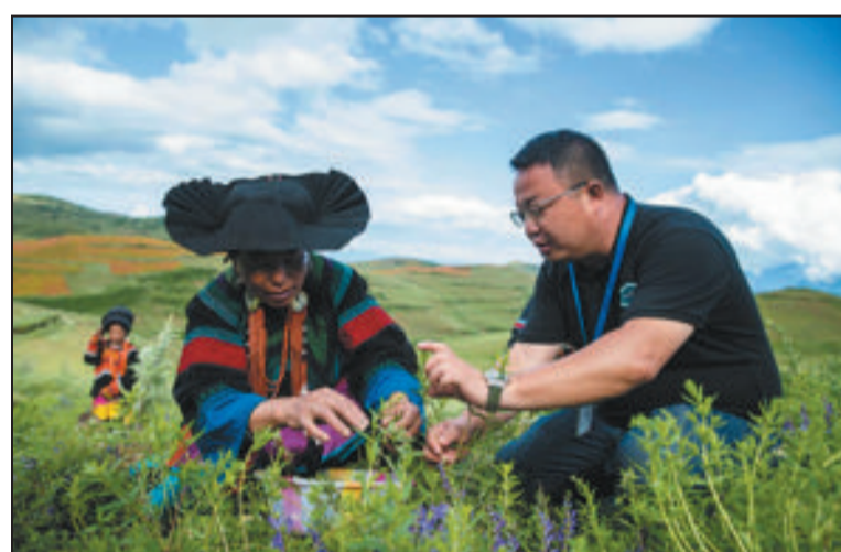
A technician teaches a woman of the Yi ethnic group the skills of planting and picking in Zhaojue county, Sichuan province.