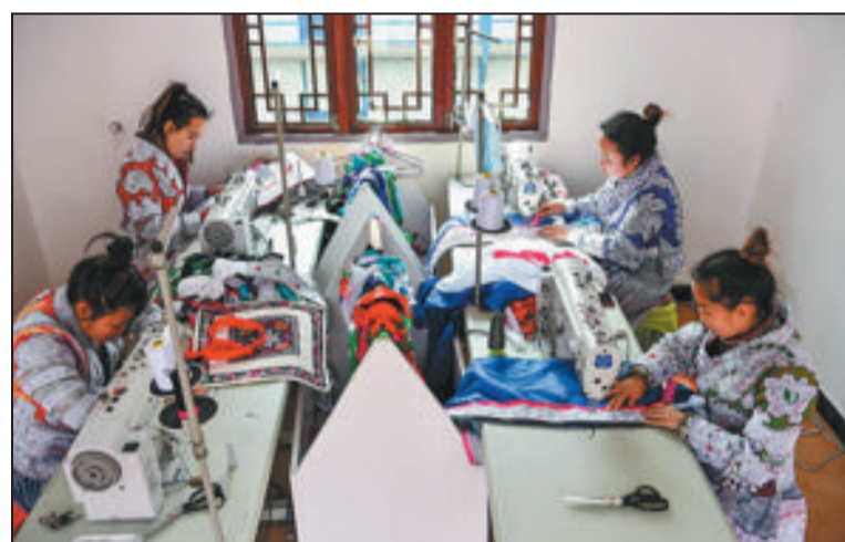
Miao ethnic group women in Huawu village, Guizhou province, make clothes in a workshop as part of a jobs program.