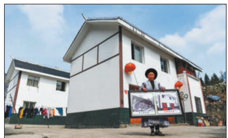
A villager from Huawu village, Guizhou province, shows photos of her previously run-down wooden house and her new home in a modern community.