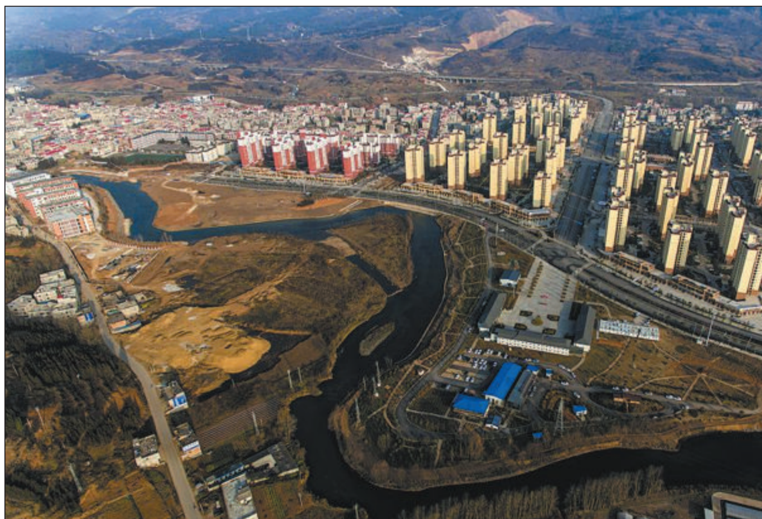
In Jing'an new area of Zhaotong, Yunnan province, new homes have been built for about 40,000 people from poor areas.