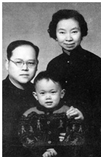
Family photo taken in 1950s