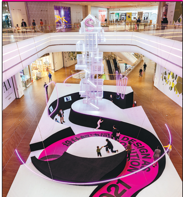
The 2021 Shenzhen Design Week has its theme as "design as solution", demonstrating the role design plays in creating innovative solutions to both the problems of today and the future.