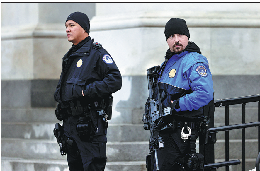
Police officers keep watch on the US Capitol in Washington on Wednesday. The United States is more deeply divided than ever a year after the deadly attack on Jan 6, 2021.

The assault on the Capitol reinforced the conclusion that American exceptionalism and competence