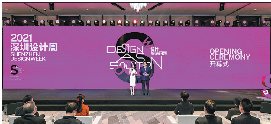
Left: The 2021 Shenzhen Design Week kicks off on Dec 25, 2021. The 10-day event invited more than 70 designers to showcase more than 300 works and hosted eight forums, attracting more than 400,000 visitors. Right: Visitors inspect the works displayed at the Shenzhen Design Week.