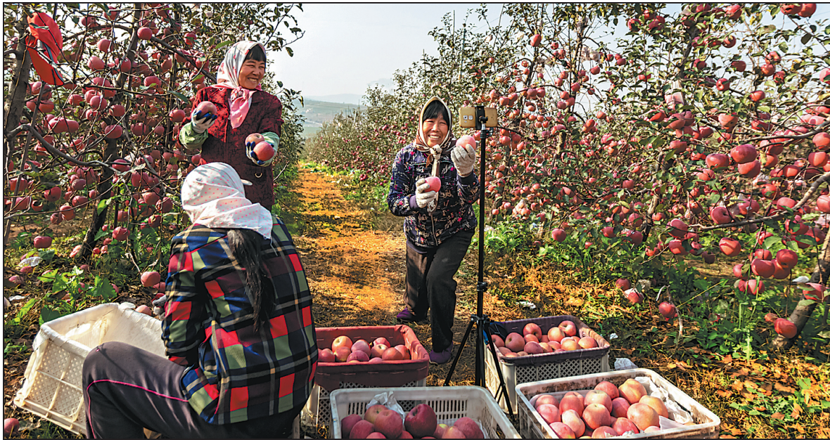
Farmers sell apples via a livestream at an orchard in Yantai, Shandong, in November.

Contact the writers at zhangyunbi@chinadaily.com.cn