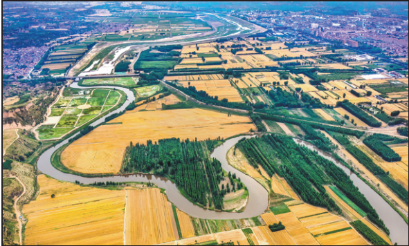
Initial progress has been made in improving the environment of the Fenhe River after years of efforts by local governments and residents.

However, with the development of an economy reliant on coal min-