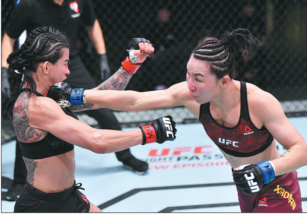
China's Yan Xiaonan connects with a jab to the chin of Brazil's Claudia Gadelha during their strawweight bout at UFC APEX in Las Vegas on Saturday.