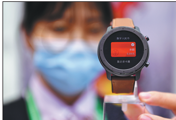
A payment terminal for digital RMB is exhibited at the China International Consumer Products Expo in Haikou, Hainan province, on Saturday.