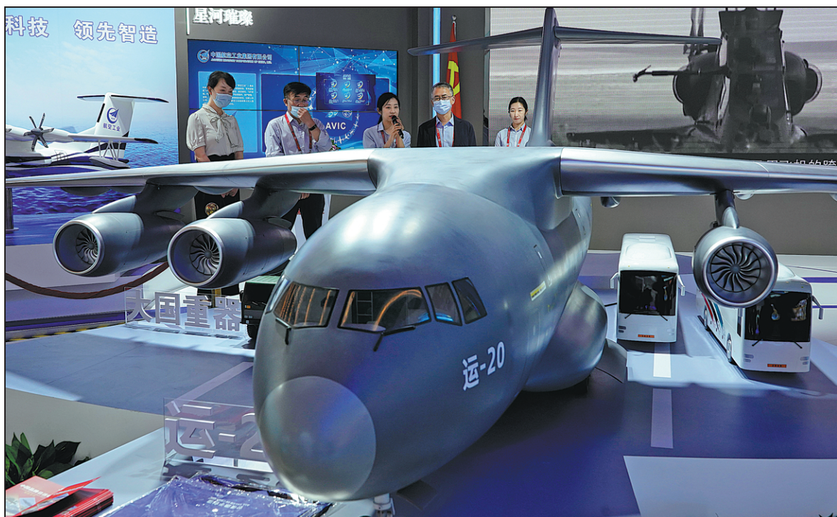
Visitors admire a model of the Y-20 aircraft, China's largest and most advanced domestically developed transport aircraft, at the opening of the 2021 China Brand Day exhibition in Shanghai on Monday. The exhibition runs through Wednesday. See story, page 3