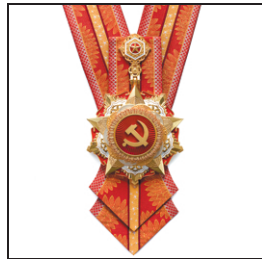
The red, gold and white July 1 Medal has as its main elements the Party emblem and a five-pointed star.

The CPC Central Committee launched a nationwide effort to garner nominations for the medal in a bid to fully showcase the rich outcomes attained by Party organizations and members in various fields and areas, and to further unify minds, inspire the people and boost their morale, according to a circular published in February.