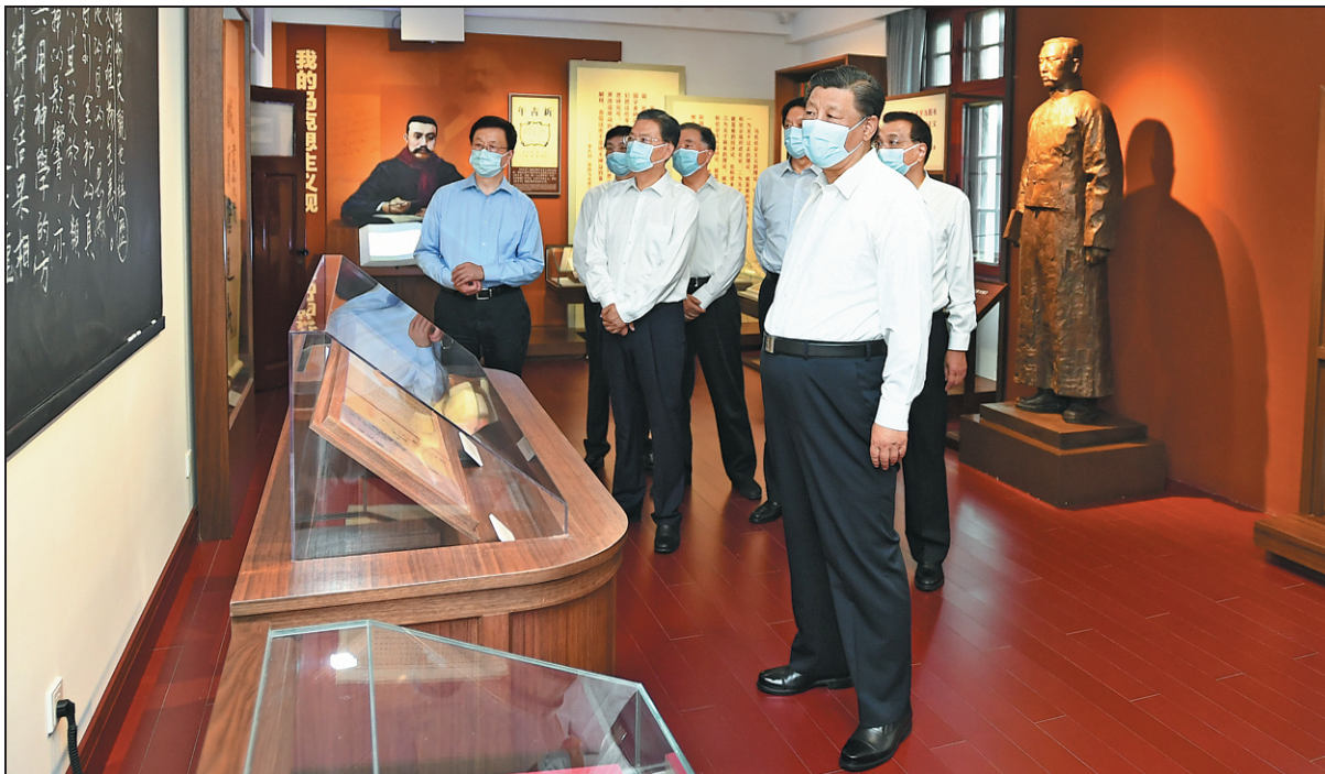
Xi Jinping, general secretary of the CPC Central Committee, and other members of the Political Bureau of the CPC Central Committee visit the "Red Building", once the main campus of Peking University, and learn about the history of the preparation and founding of the CPC at an exhibition in Beijing on Friday.