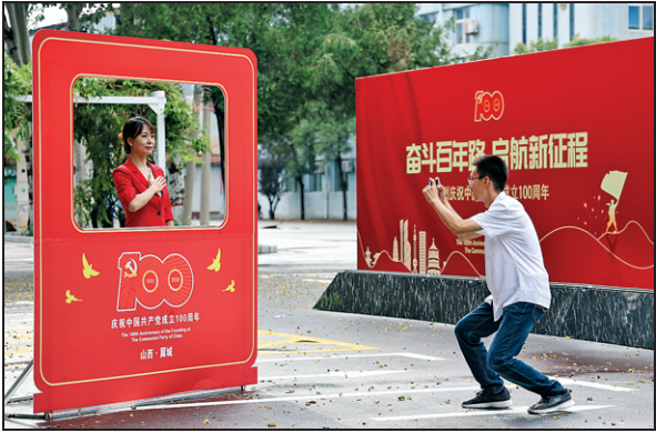
Clockwise from right: Residents in Yuncheng hold up a huge Party flag to celebrate the birthday of the CPC. A resident in Yicheng county poses for a photo on a street decorated in a festive atmosphere. Business representatives in Zuoquan county sing in chorus to mark the 100th anniversary of the Party.