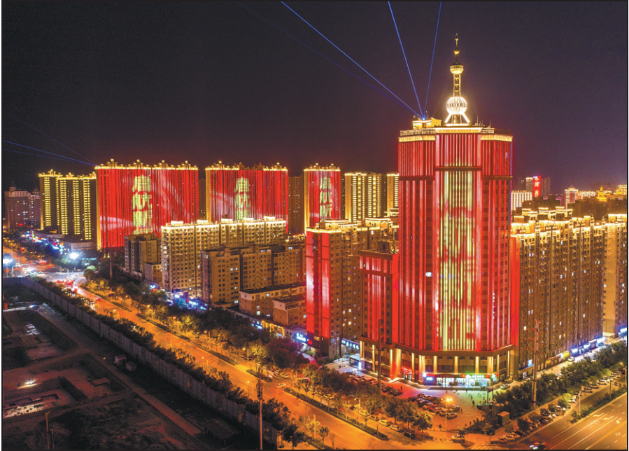
From left: Staff members at Fenjiu Group sing in a concert to celebrate the CPC birthday. Buildings in Taiyuan are decorated in red to mark the centennial of the CPC.