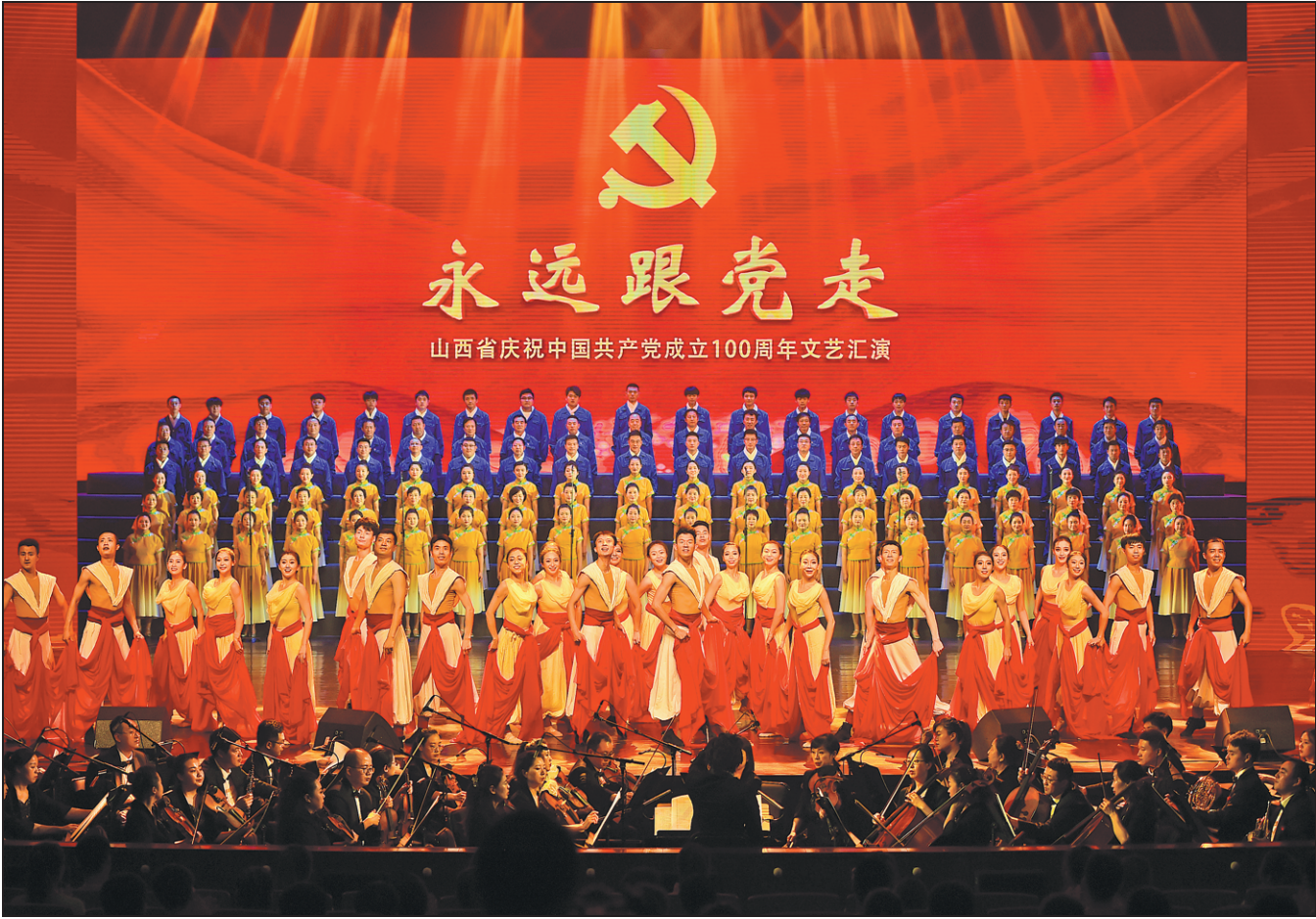
An evening gala is held at Shanxi Grand Theater in Taiyuan on June 30 to celebrate the 100th anniversary of the founding of the Communist Party of China.

Party members look back upon centenary of history, development