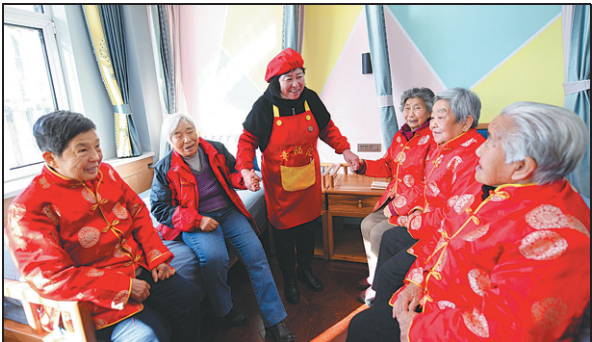
Residents in Taiyuan enjoy socializing at a community elder care center.