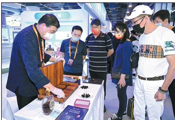
A Shanxi company exhibits its health food during the 2021 China International Fair for Trade in Services.

At the fair, Shanxi's major flagship companies in the service industry, including Shanxi Cultural Tourism Group, Shanxi Cloud Era Technolo-