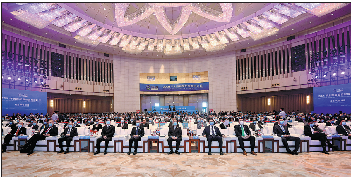
Government officials, industry experts and business representatives from home and abroad attend the Taiyuan Energy and Low-Carbon Development Forum held from Sept 3-4.