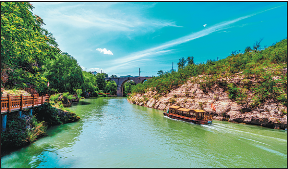
From left: Tourists have a boat tour of the Niangziguan village in Pingding county. Songmiao village in the county of Lingchuan is known as a convalescent destination that offers 'sleep-aiding' tours. Qiaoshang in Huguang county is recognized as one of the most beautiful and livable tourism villages in Shanxi.