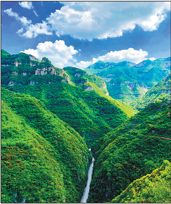
Clockwise from left: Tongtian Gorge, a part of the Taihang Mountains, is one of the top tourist destinations in Changzhi. Zhangze Lake Wetland Park is the venue where the seventh Shanxi Conference on Tourism Development took place. Artists perform a traditional dance during the gala night on Sept 26.

It is among the earliest regions in which human activity was discovered. It is home to Chinese legends such as Nyuwa, the goddess who created humans and mended the broken sky, and a legendary bird called Jingwei, which kept picking up stones and tree branches to fill up the sea.