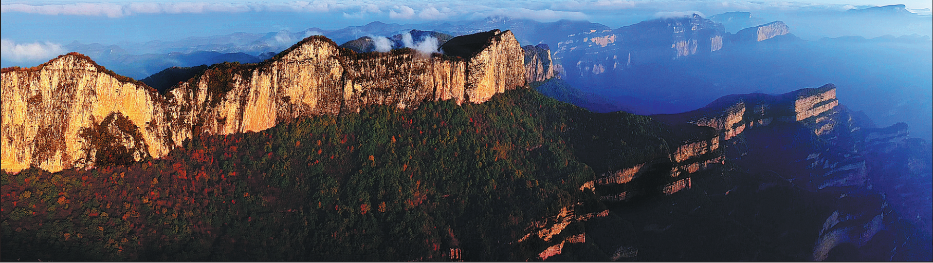
Featuring rising cliffs, lush woods and clear streams, the Taihang Mountains that stretch some 400 kilometer from the north to south, are a major attraction in Shanxi province.

Gala night and conference in Changzhi bring province's magnificence and charm into spotlight