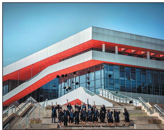
The 10-year-old Wenzhou-Kean University is a role model for Sino-foreign cooperation in running schools.

In the 2020-25 period, the university will further expand its enrollment scale, increase investment in infrastructure construction, set up master and doctoral programs, and vigorously conduct scientific research. By 2025, the number of students in the school is expected to reach 7,000, including 500 master's and doctoral students, 31 majors and 11 master and doctoral majors.