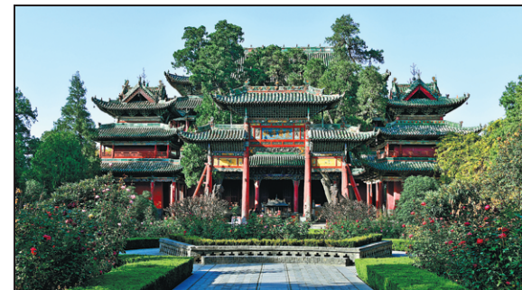
The Guandi Temple in Haizhou is the largest temple in China dedicated to the worship of Guan Yu.