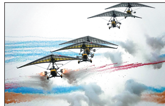
A paraglider air display is held at Yaocheng Airport in Taiyuan in September 2020.