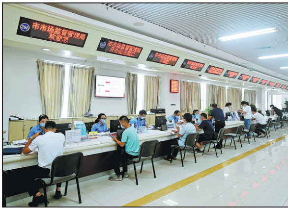
Businesspeople take advantage of one-stop services at Zhanjiang's administration for market regulation.

tions for opening businesses will be finished within half a workday by the end of this year. The city will also promote one-stop services for entrepreneurs to register new start-ups and provide them with free engraving of official seals and invoice stamps.