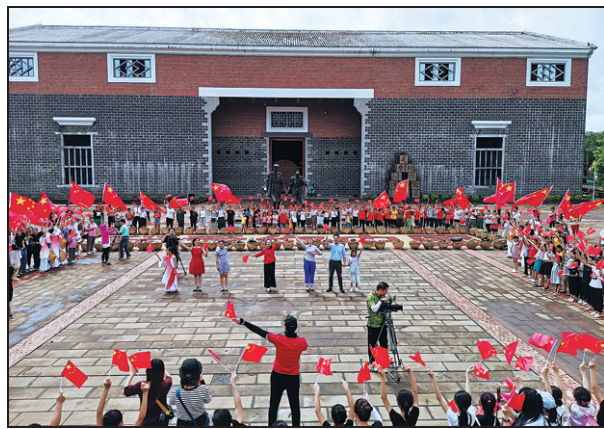
Villagers celebrate their poverty alleviation success during a flash mob event in Zhanjiang.

Zhanjiang took the lead in formulating a city-level plan for rural revita-