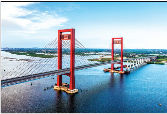
The Tiaoshun cross-sea bridge is put into service in Zhanjiang on Monday.