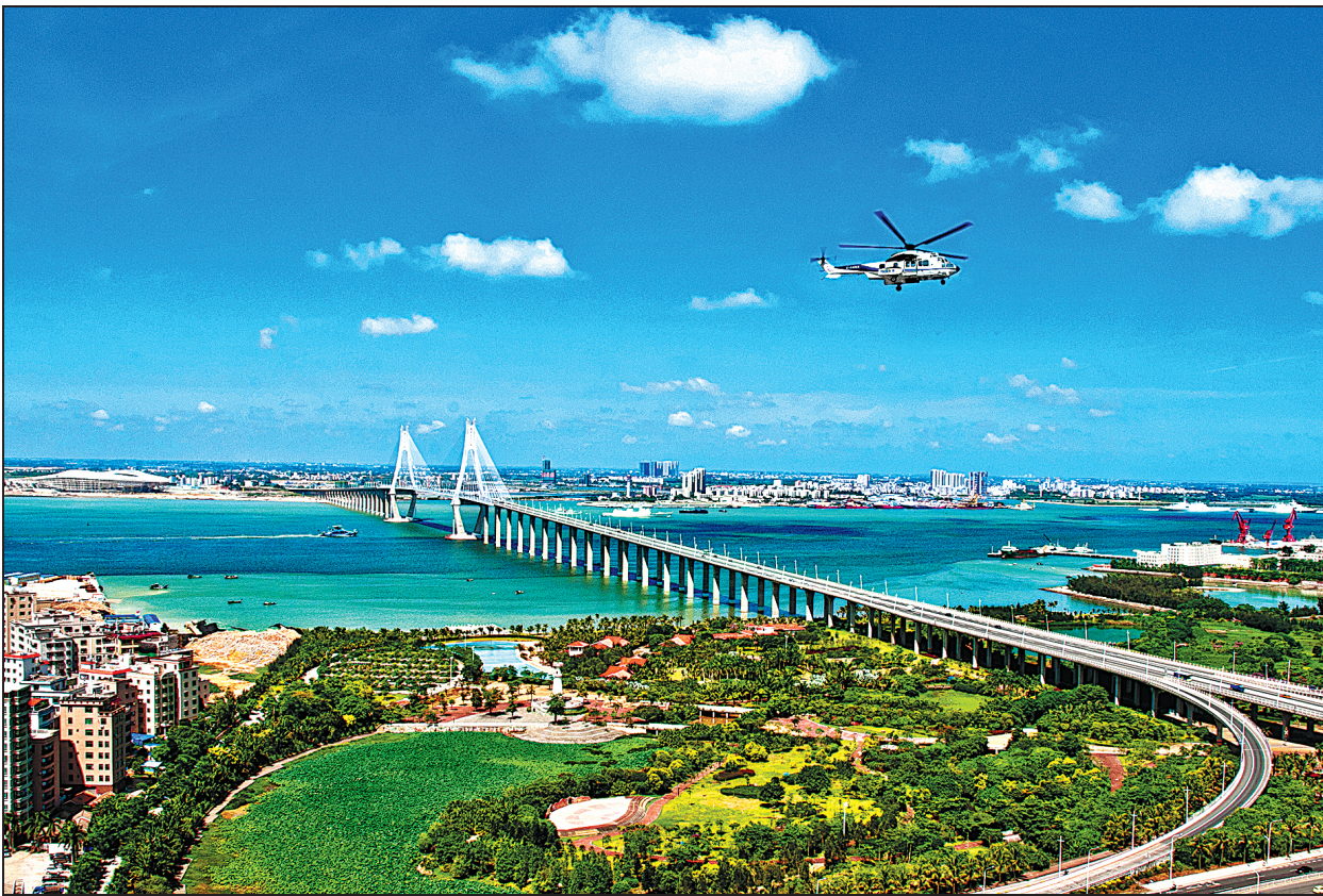
A helicopter flies over a cross-sea bridge in Zhanjiang, Guangdong province.

It will forge ahead with reforms and further expand opening-up in the future to provide a vital backup to the country's dual circulation development pattern, according to the city government.