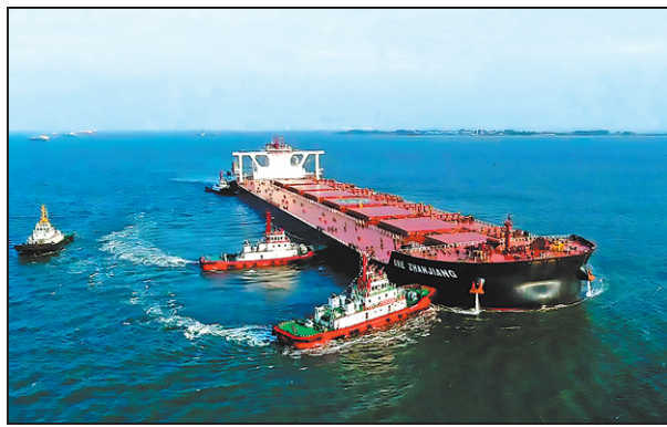
The Ore Zhanjiang carrier is guided to dock at Zhanjiang Port in June.

Following suit, Air Liquide, a world leader in gases, technologies and services for industry and health, decided to invest in the city in 2020. Dow, a materials science leader, signed a memorandum of understanding to launch a South