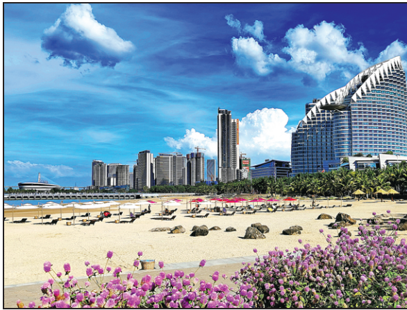
The coastal city of Zhanjiang boasts an appealing natural environment.

Adopting 116 leading environmental protection technologies in the industry, the project is close to