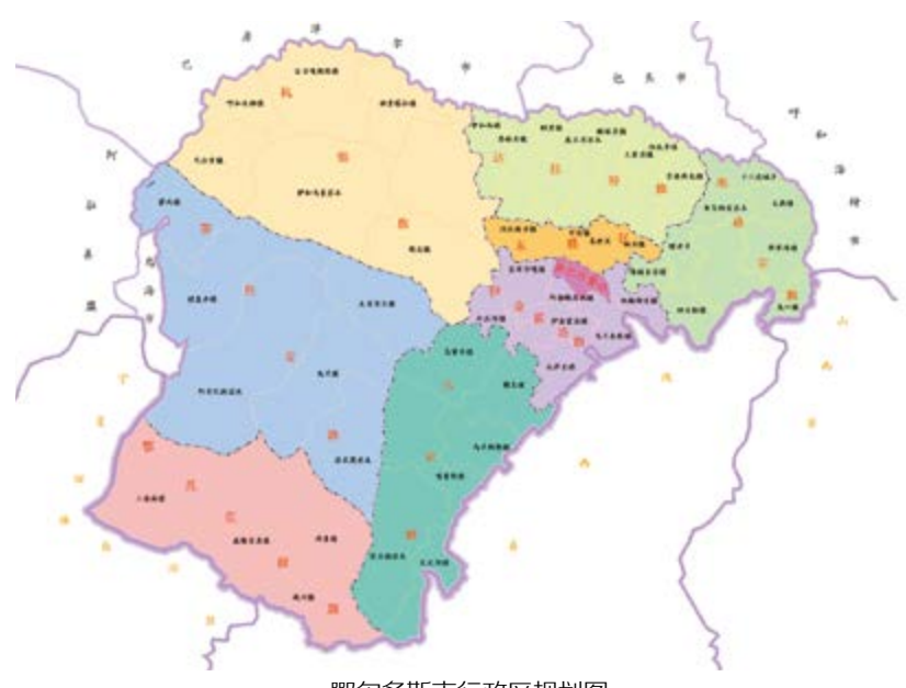
鄂尔多斯市行政区规划图 Ordos' Administrative Division

Overview of Desertification Combating in Ordos