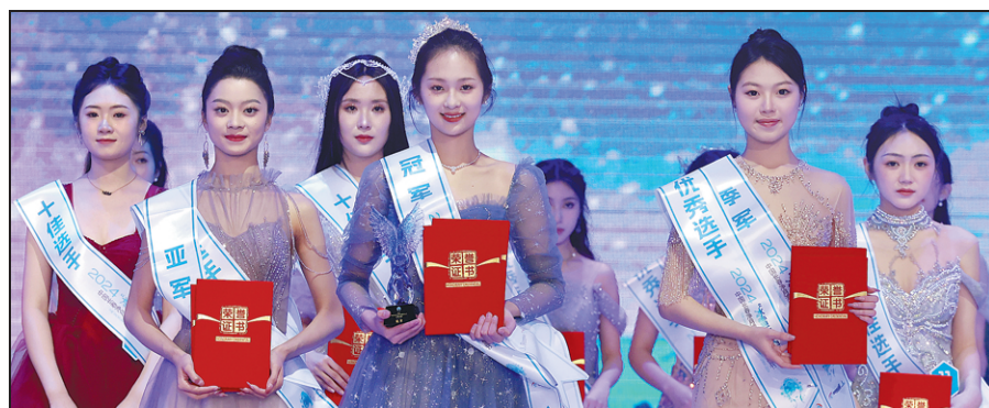
The finalists of the Snow Angel of Vasaloppet China 2024 competition make their appearance at the awards ceremony held in late December.