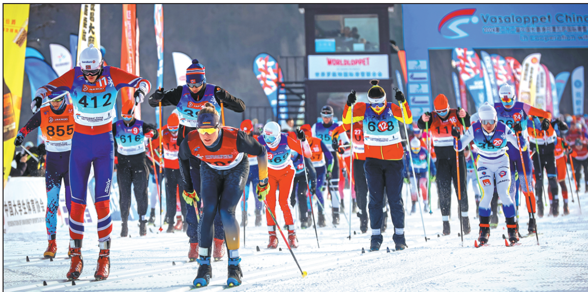
The 22nd China Changchun Jingyuetan Vasaloppet International Ski Festival kicks off on Thursday.

The competition series uses a 25-km-long track certified by the International Ski and Snowboard Federation and has established a professional referee team, organizers said.