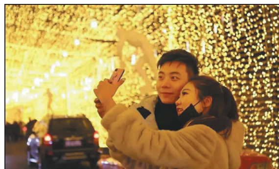
Visitors take pictures at the popular tourist attraction Jingyuetan starlight tunnel in Changchun, Jilin province.

Focusing on agricultural facilities, brands and traditional customs, the 14th Jilin (Changchun) Winter Agricultural Expo, which is scheduled to run from Jan 28 to Feb 16, will launch more activities to echo the Spring Festival as well as promoting agriculture and ice and snow tourism, local officials said.