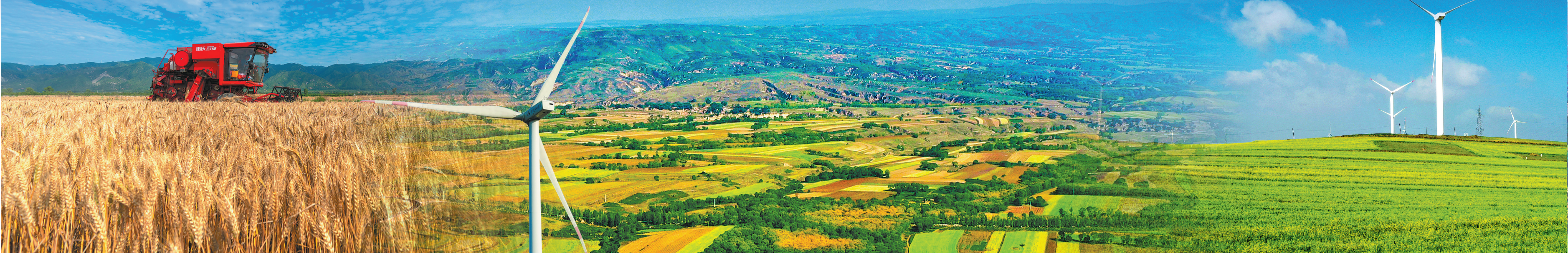
Agricultural modernization and the development of new energy resources, like solar and wind power, are among the many areas where businesses across Europe can find opportunities for cooperation with Shanxi.

Province's enterprises explore mutually beneficial ties in cities of Birmingham, London and Barcelona