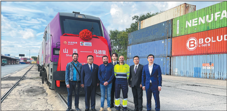
From left: The first freight train from Shanxi to Spain is met by representatives in Madrid on Oct 16, 2023, a major milestone of China-Spain. An aerial view of a massive solar farm in Shilou county, Shanxi province. Blue skies above a coking plant in Shanxi are evidence of the province's achievements in the clean production of energy. An interprovincial power transmission line from Shanxi supplies electricity to the rest of the country.