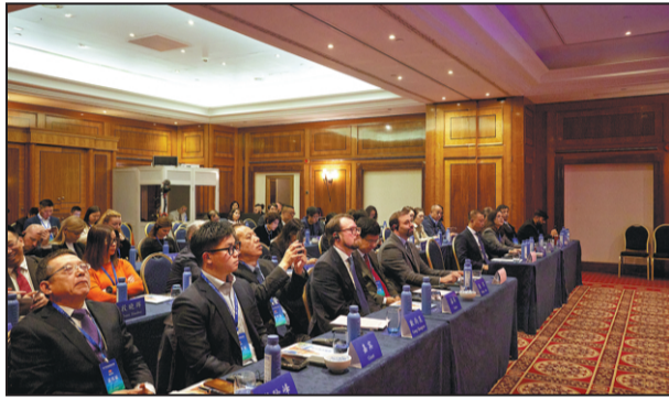
Attendees of the London promotion event listen to a Shanxi official's speech about the business opportunities in the Chinese province.

The event included activities to publicize Shanxi's business environ-